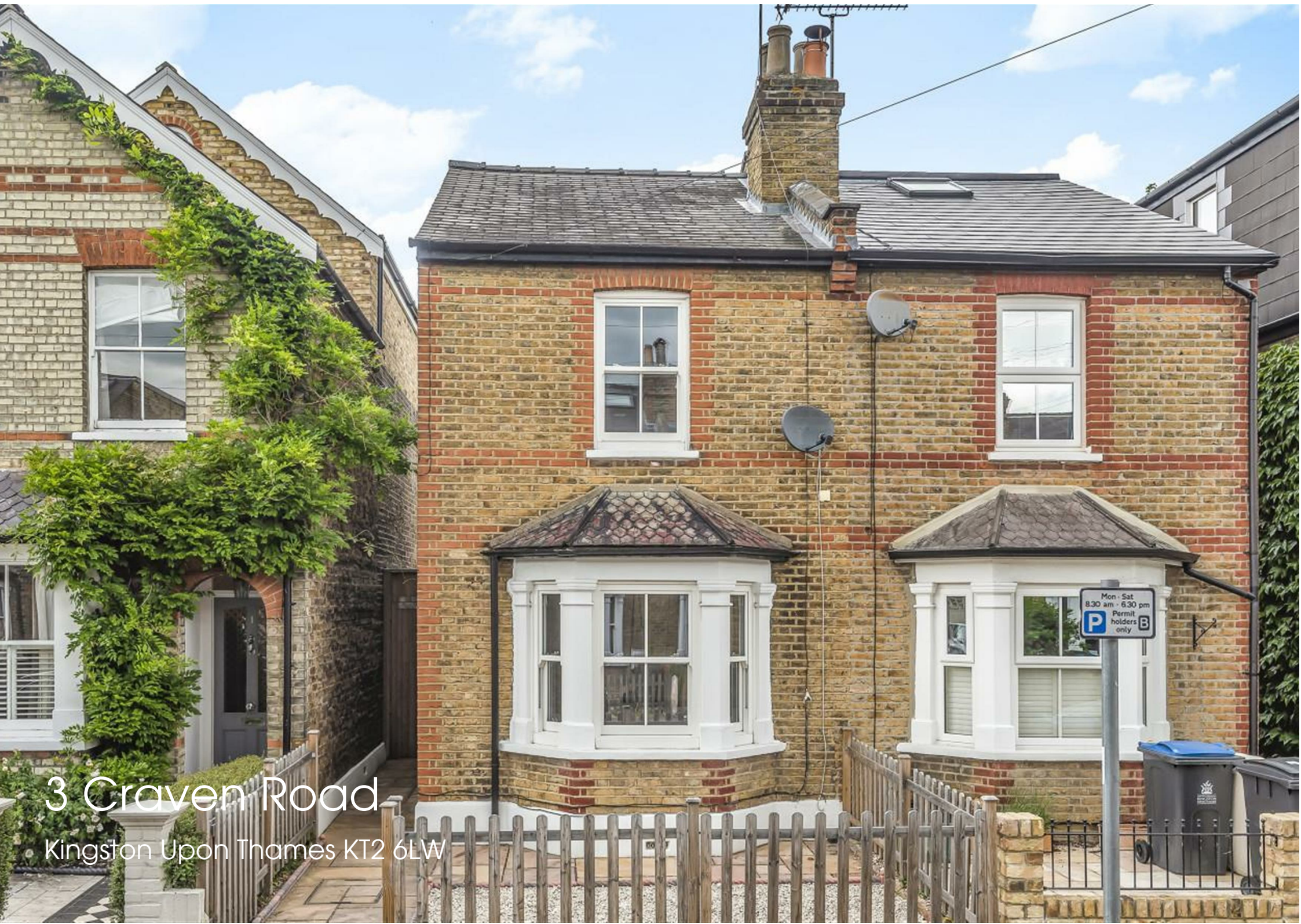
3 Craven Road Kingston Upon Thames KT2 6LW